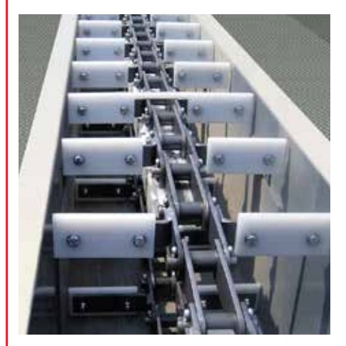
Not binding, subject to change. Version 2017 / 1.1

Chutes and vibration chutes, chain conveyor base plates, crushers, conveyor belt supports and scrapers, stone drums, road construction machinery, coal and ore processing systems etc.