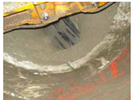
Not binding, subject to change. Version 2017 / 1.1

Slurry pump impellers, sand screw conveyors (classifier shoes), conveyor belt supports, cyclones, elbows in pneumatic & hydraulic conveyor systems, washing systems, dump boxes and filter systems, etc.