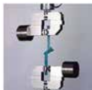
Trouser tear strength