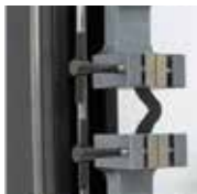
Angle tear strength