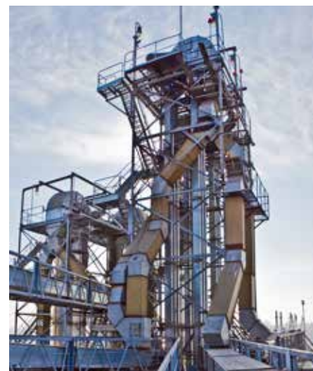
Not binding, subject to change. Version 2017 / 1.1

Weighing bunkers, silos, chutes, elevators, hoppers etc.