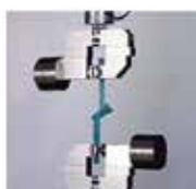
Trouser tear strength