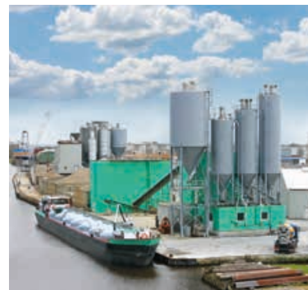
Not binding, subject to change. Version 2017 / 1.1

Concrete mixers, weighing bunkers, silos, pipework systems, chutes, hoppers (sand, gravel and minerals), tip-over and drop points, scrapers, elevators and skirting for belt conveyors, etc.