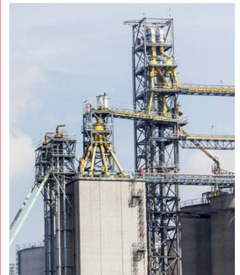
Not legally binding - subject to change and terms Version 2017 / 1.3