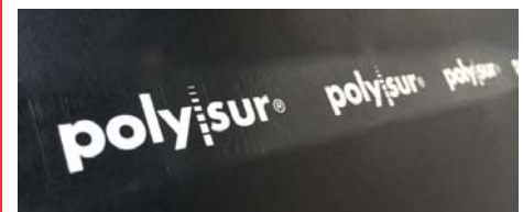
Polysur® elevator belts are provided with a Polysur® logo after each 20 meter of elevator belt.

Other constructions available on request.