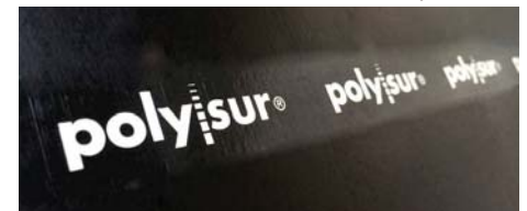
Polysur® elevator belts are provided with a Polysur® logo after each 20 meter of elevator belt.

Other constructions available on request.