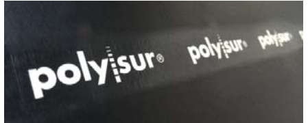
Polysur® elevator belts are provided with a Polysur® logo after each 20 meter of elevator belt.

Other constructions available on request.