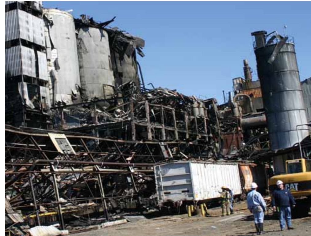
Aftermath of a dust explosion and resulting fire in the bulk and process industry

We offer you complete advice with a clear (problem) analysis, the right design and solution, proper installation and long term planning for maintenance.